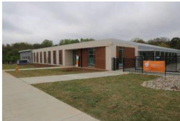
Oak City Multiservices Center is located at 1430 S. Wilmington Street in Raleigh

Since the Oak City Outreach Center moved to South Wilmington St. and changed the name to Oak City Cares we have not seen as many children. July was different. There were several mothers with young children. Just like the adults that we see, the children are grateful and say, "thank you".